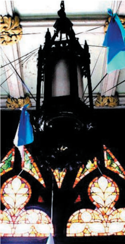
Heavy, July 2010

Since acquiring St. Joseph's church from the City of Albany in 2003, Historic Albany Foundation has managed the stabilization of the building with the assistance of a $300,000 NYS Environmental Protection Fund matching grant and also received other funding to repair the building. To date we have raised well over $350,000 as our part of the matching grant. Donations have come from Historic Albany members, from ad-hoc groups such as Committee 150 and from former St. Joes parishioners.