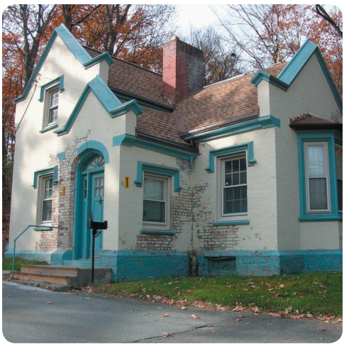
799 SOUTH PEARL ST