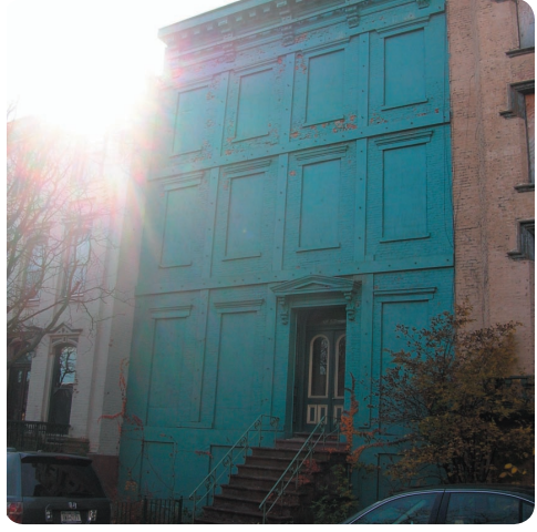
4 HALL PLACE