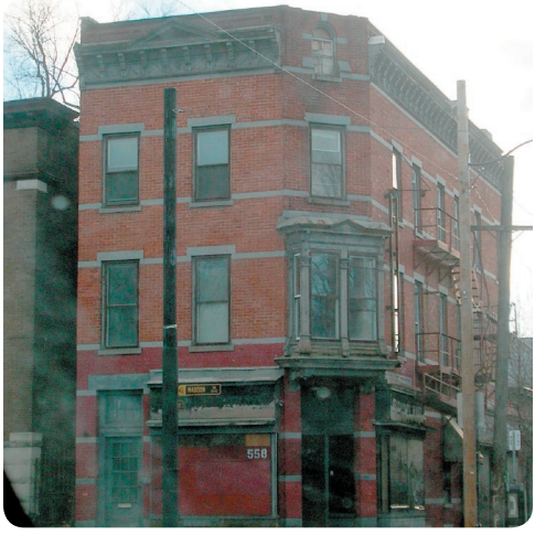
558 MADISON AVE