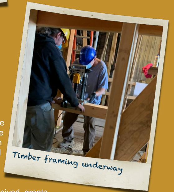
Timber framing underway