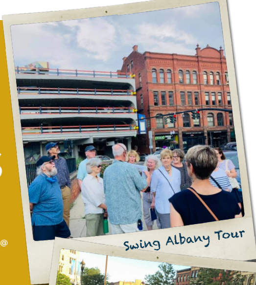
Swing Albany Tour