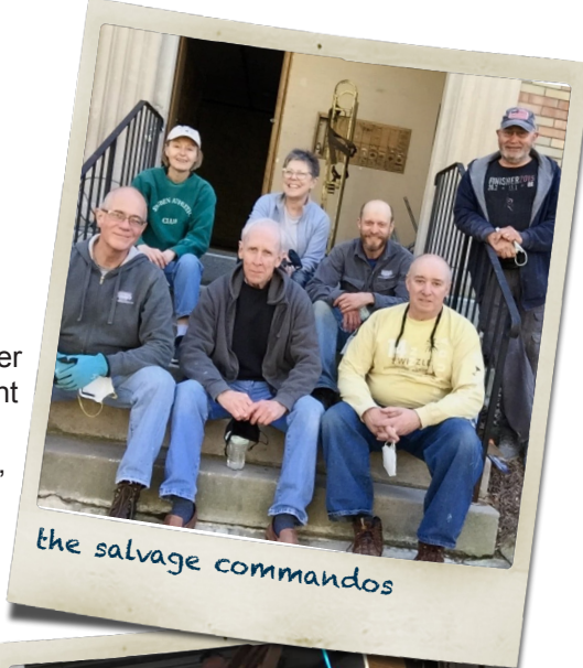
the salvage commandos