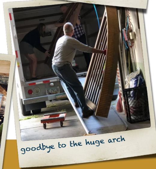
goodbye to the huge arch