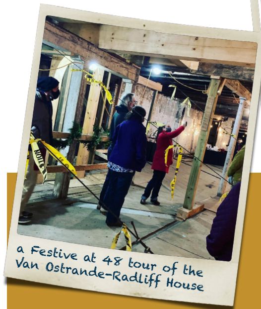
a Festive at 48 tour of the Van Ostrande-Radliff House