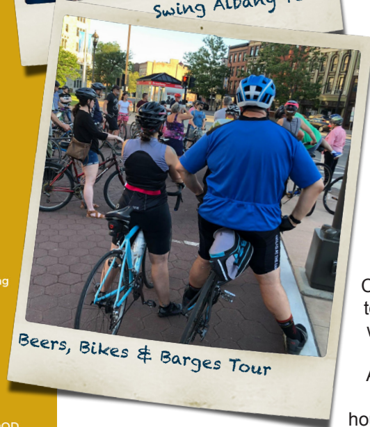
Beers, Bikes & Barges Tour